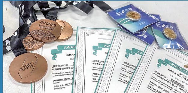
Students win OneShow International Advertising Award