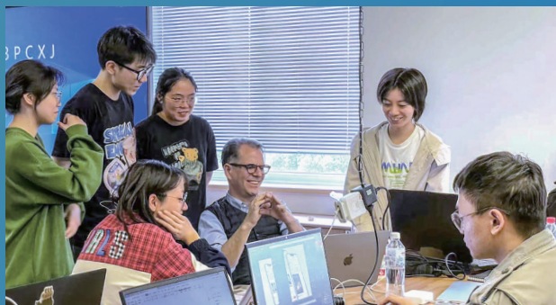
Teaching in class

Graduates can pursue overseas further study, or work in interactive design, web and interactive media, game design, digital media and other related enterprises, undertaking creative and development work in digital media design, virtual reality and augmented reality design, interactive interface design, interactive display design, etc.